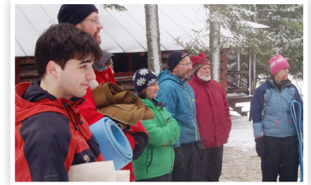
Students debrief a simulation during the course.

The W.F.A. course was partially underwritten by the Center for Environmental and Outdoor Education as professional development for our instructors working courses in the Adirondacks. Going forward, the ten-day W.F.R. and the two-day WFA courses will be offered during January break in alternate years. They are open to anyone who needs to be certified or wants to improve their knowledge of backcountry medicine.