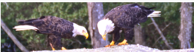
Nature Nook Lunch near Kirby Camp.

The Bald Eagle is a large powerful raptor that has returned to the Raquette Lake area in recent years. The Adirondacks provide great habitat with tall trees lining lakes and rivers. In the mid-to late-20th century the majestic birds were disappearing from our landscape due to hunting and lethal pesticides. After the Bald Eagle was protected by the Endangered Species Act in 1978, they have slowly rebounded. In July 1995, the birds were removed from the federal endangered list.