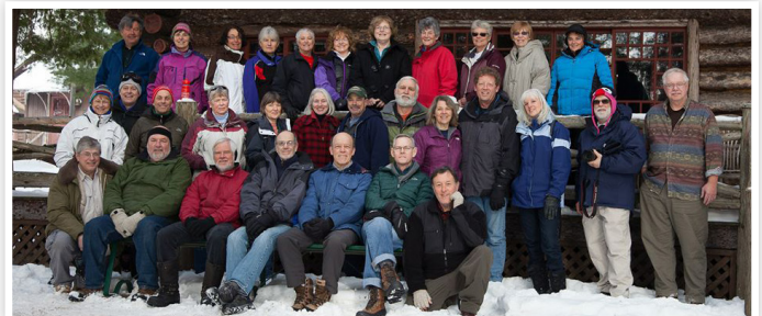
Thirty alumni and friends gathered Feb. 16-21 for a week of fun, recreation and memories at Camp Huntington. For the second year in a row, the annual Winter Alumni Camp took place in February during ideal winter conditions.

For more information cortland.edu/rl-events