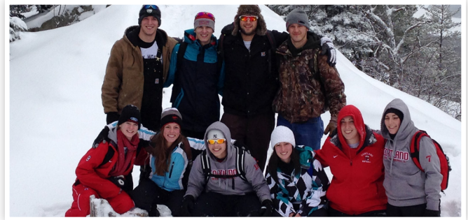
Athletic leaders pose after climbing Bald Mountain.