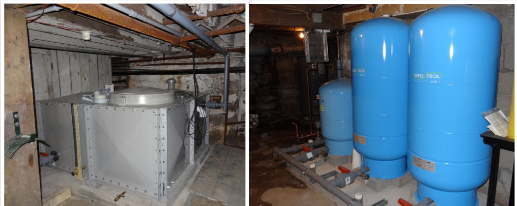
Storage and pressure tanks installed in the basement of the Antlers Main Lodge.

Raquette Lake News is published twice a year (fall/spring semesters) by the Center for Environmental and Outdoor Education at SUNY Cortland.